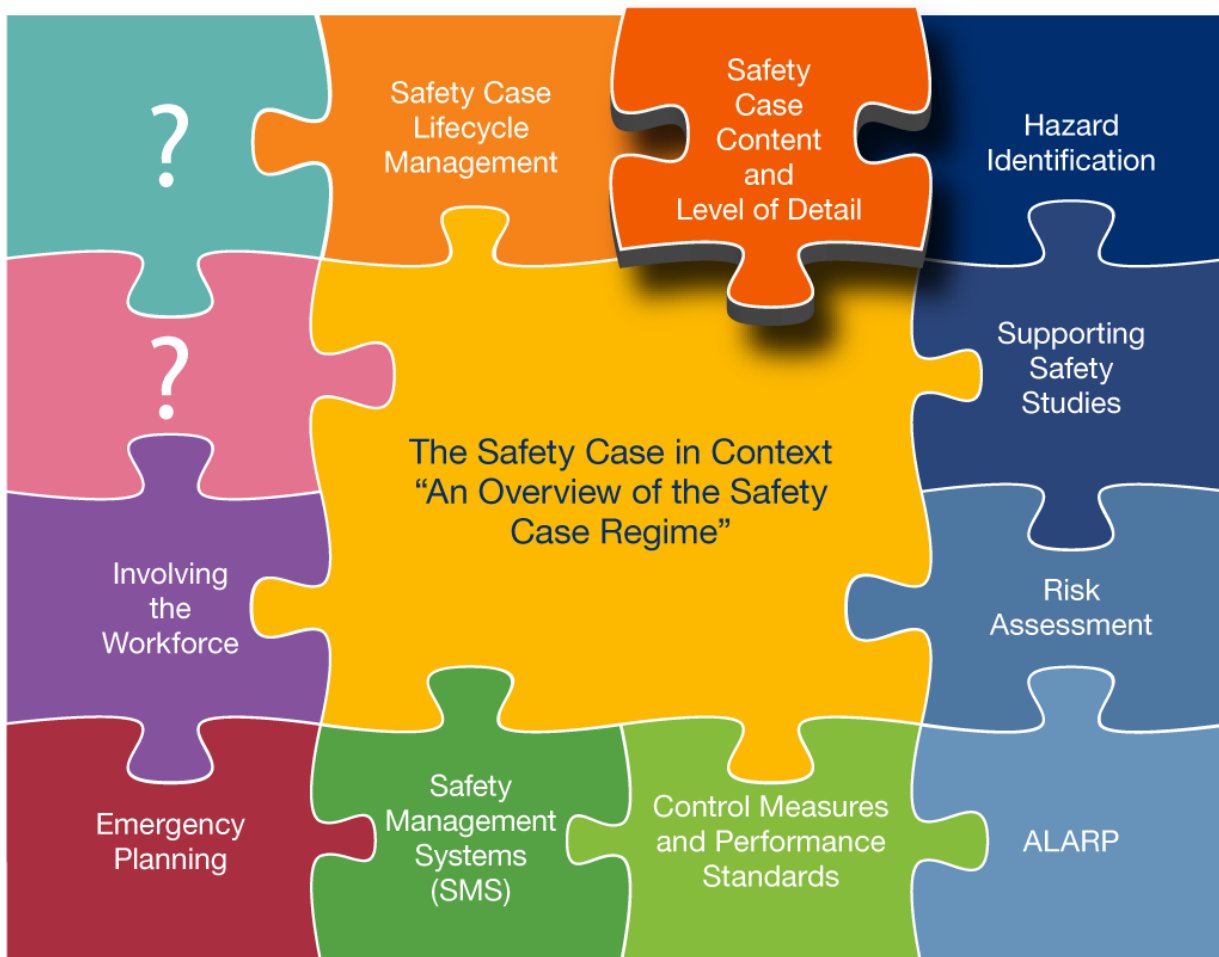
Figure 1 – Safety case guidance note map

The purpose of the guidance is to explain the objectives of the regulations, to identify the general issues that should be considered, and to provide practical examples to illustrate the concepts and potential approaches that can be taken in the preparation of safety cases. The guidance is intended for use by industry and NOPSEMA inspectors in the preparation and assessment of safety cases. It is not, however, the intention of the guidance to provide detailed approaches or regulatory assessment criteria.