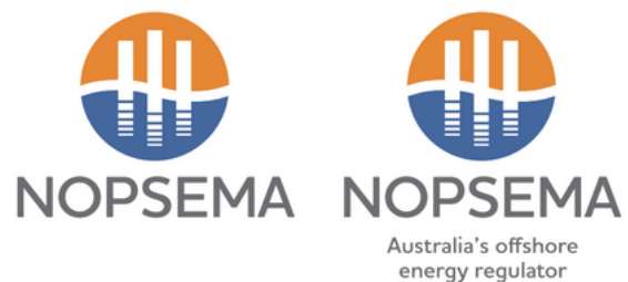
NOPSEMA's Vertical Logo