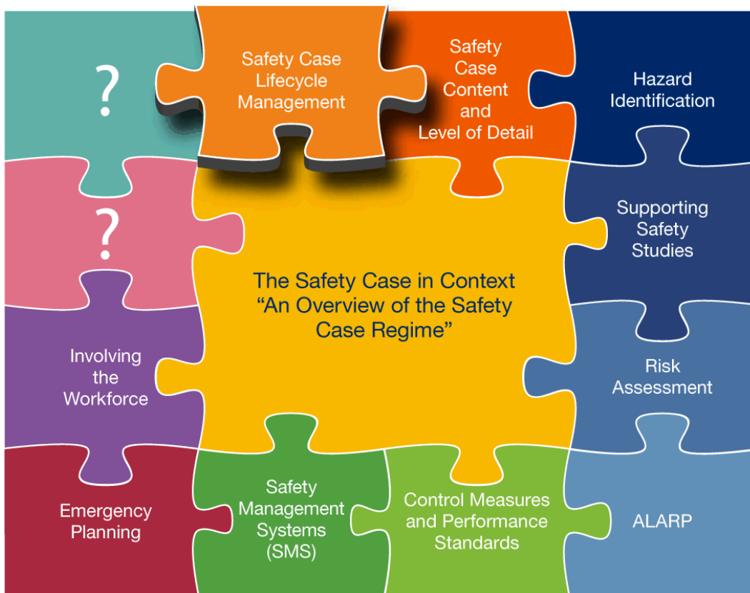
Figure 1 – Safety Case Guidance Note Map

Figure 1 illustrates the scope of the NOPSEMA safety case guidance notes overall, and their inter-related nature. The guidance notes are available on the NOPSEMA website, along with guidance on other legislative requirements such as nomination of operators, validation, and notifying and reporting accidents and dangerous occurrences.