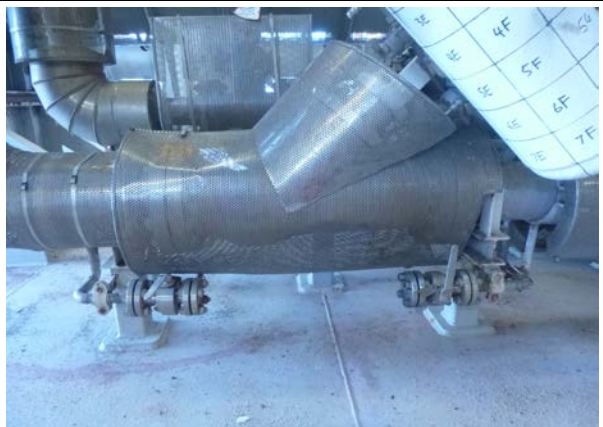
Figure 1 –Example of inconsistent bracing deck SBC