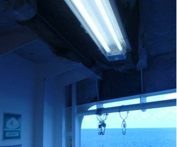
Figure 7 – leaking seawater fire pump B